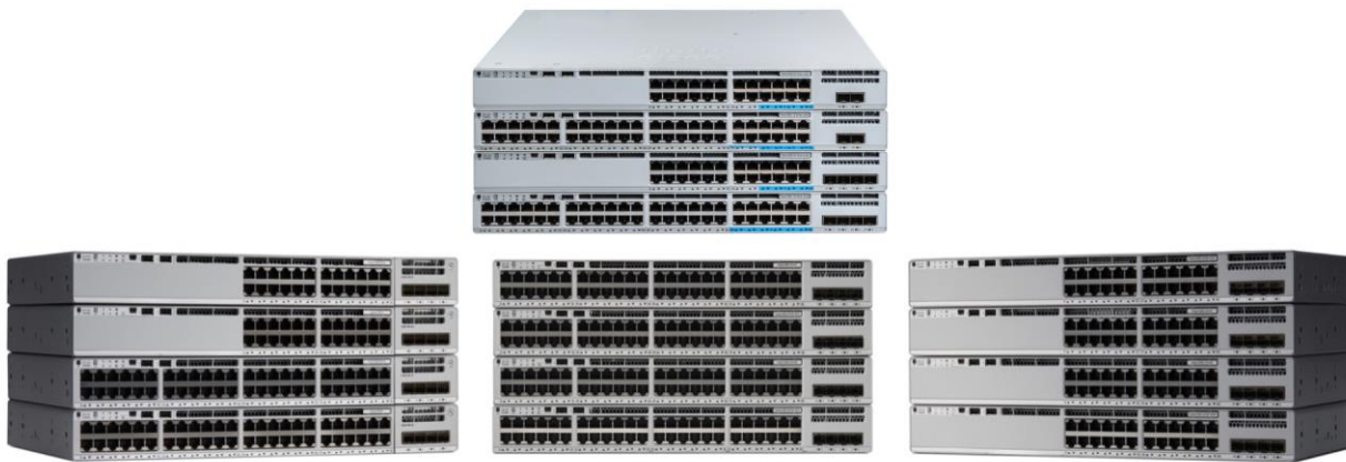
Figure 1. Cisco Catalyst 9200 Series switches

The Cisco Catalyst 9200 Series is made up of modular (C9200) and fixed (C9200L) switch models.