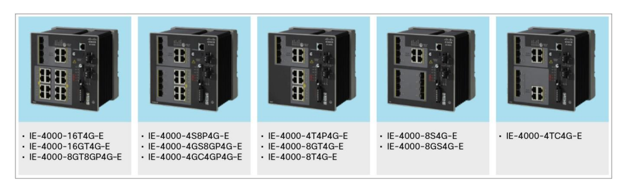
Figure 1. IE 4000 Models

Figure 1 shows switch models, Table 2 shows all the available Cisco IE 4000 Series models, Table 3 list the SW license PIDs and Table 4 lists the power supplies for Cisco IE 4000 Series Switches.