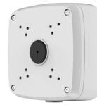
PFA121 Junction box