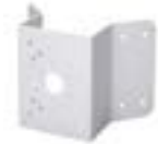
PFA151 Corner Mount