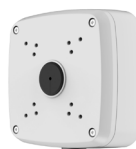
PFA121 Junction box