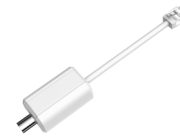
LR1002 ePoE Over Coax Converter