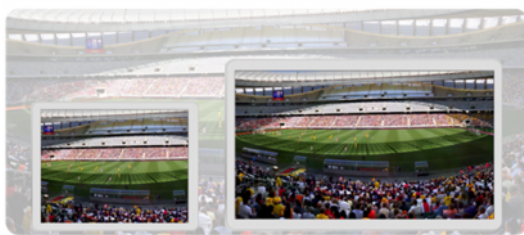
4:3 Normal View