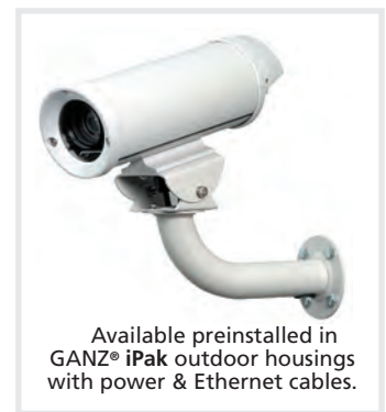
Available preinstalled in GANZ® iPak outdoor housings with power & Ethernet cables.