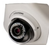
GBR-CM02 Corner Mount Adapter for Vandal-Resistant IP Dome Camera