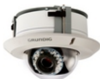
GBR-IC02 Flush-Mount Adapter for Vandal-Resistant IP Dome Camera