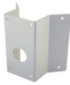
GBR-CM01 Corner Mount Adapter