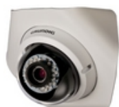
GBR-CM02 Corner Mount Adapter for Vandal-Resistant IP Dome Camera