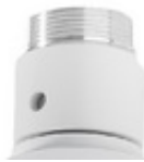
GBR-AM02 Adapter Ring for Pelco Pendant Mount with 1,5" NPT thread