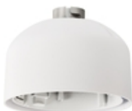
GHO-M018 External housing, for vandal-resistant, IP dome camera