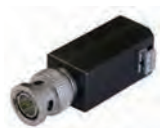
Video balun DS-1H18