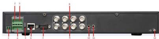
Rear Panel of DS-6604HFI-SATA