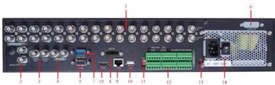
Rear Panel of DS-9116HFI-RH