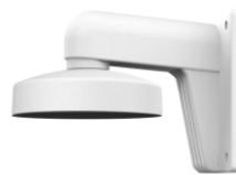
Wall mount DS-1272ZJ-110