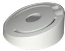
Inclined ceiling mount DS-1259ZJ