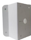
DS-1276ZJ-SUS Corner mount