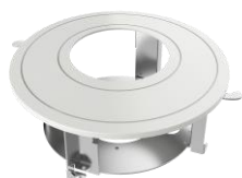
DS-DS-1227ZJ-DM42 In-Ceiling Mount