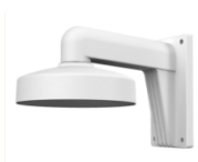
HIA-B401-110T Wall Mounting Bracket