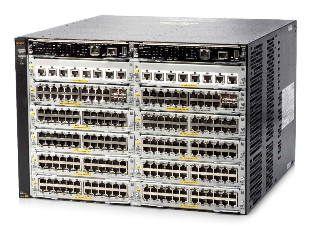
Aruba 5412R zl2 Switch

Based on a powerful ProVision ASIC, the Aruba 5400R zl2 Switch Series has a high-speed, high-capacity architecture with 2 Tbps crossbar switching fabric with low 2.1\mu robust feature support, and value with flexible programmability for the latest applications. This series offers flexible connectivity options with 6 or 12 slot compact chassis, line rate 40GbE, up to 96 line rate Smart Rate multigigabit or 10GbE ports and up to 288 ports of PoE+ for powering access points, cameras and IoT devices. The 5400R is easy to deploy, use and manage using Aruba AirWave or Aruba Central. Aruba ClearPass offers centralized security and external captive portal support. The switches include a Limited Lifetime Warranty.