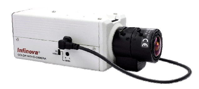
(Lens not included)