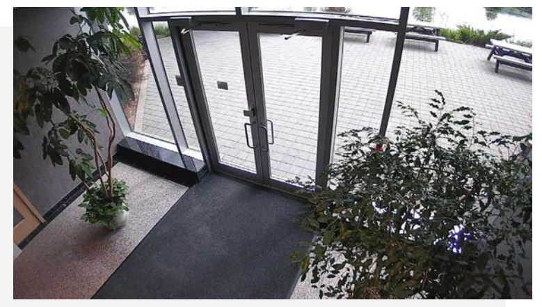
2.8mm lens. This wide-angle lens is very common in the industry, but you miss critical details due to the limited field of view.

Compare these two scenes, one using an industry-standard 2.8mm lens, and one using the SE2 Indoor NanoDome's 2.3mm lens.