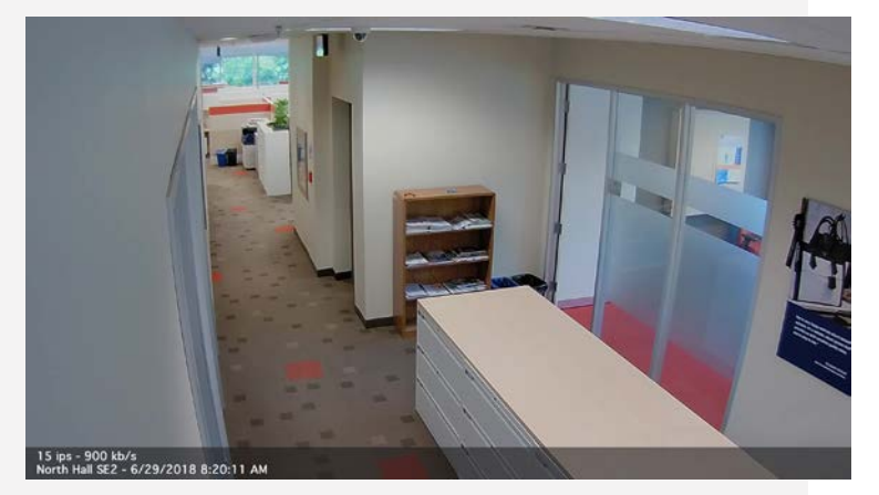
Low-complexity scene. Bit rate = 900 Kbps @ 15 fps (1080p)

The camera's low bit rate setting reduces storage and bandwidth usage by 50% or more in most applications; streams can drop below 1 Mbps at 2 MP (15 fps).