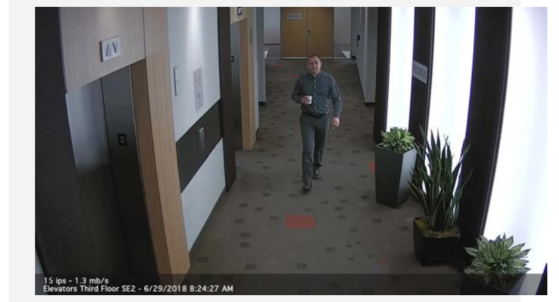
Medium complexity scene. Bit rate = 1.3 Mbps @ 15 fps (1080p)