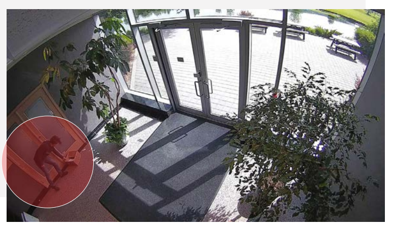
2.3mm lens. With the SE2 lens, you see a much wider area, and capture the action that tells the whole story.