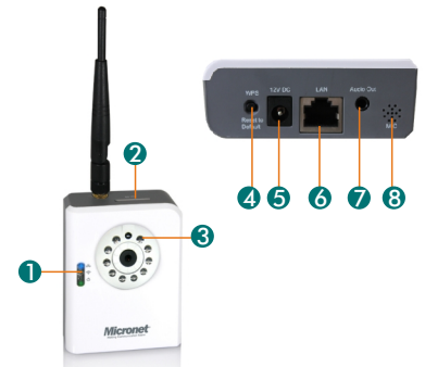
SP5522SP/SP5522SW 1.3 Megapixel IP Camera