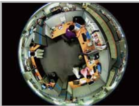
360° source view