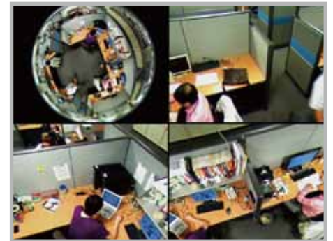
3 PTZ with source