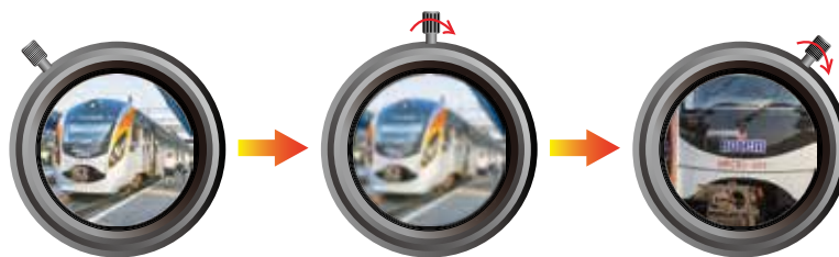
Vari-focal lens for available focal lengths

The ICA-5250V incorporates the mega-pixel vari-focal lens, which has the options of selecting a high millimeter setting for narrow viewing fields or a low millimeter setting for wider viewing fields. The ICA-5250V provides three individually configurable motion detection zones. The camera can record video or trigger alarms or alerts when camera image is tampered.