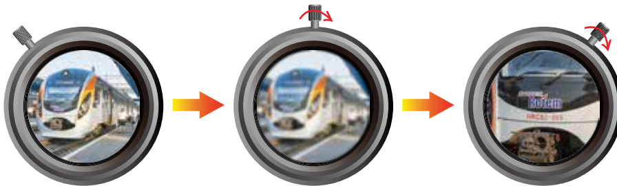
Vari-focal lens for available focal lengths

The ICA-5550V incorporates the mega-pixel vari-focal lens, which has the option of selecting a high millimeter setting for narrow viewing fields or a low millimeter setting for wider viewing fields. The ICA-5550V provides three individually configurable motion detection zones. The camera can record video or trigger alarms or alerts when camera image is tampered.