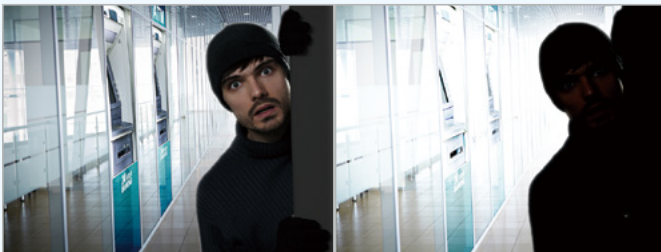
With WDR Pro II