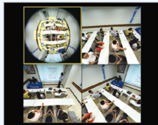
103R dewarped view