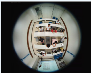
10 360° view