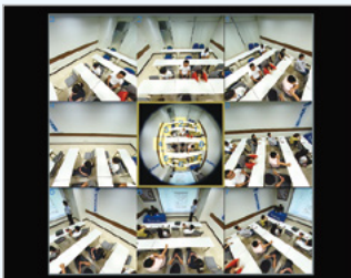
108R dewarped view