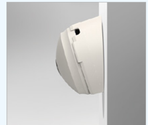
15° Wall-mount Bracket