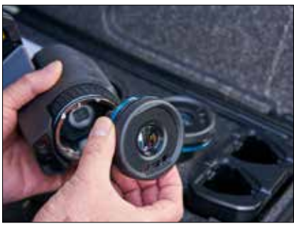
Share lenses (wide angle to telephoto) across your fleet of cameras thanks to AutoCal™ optics