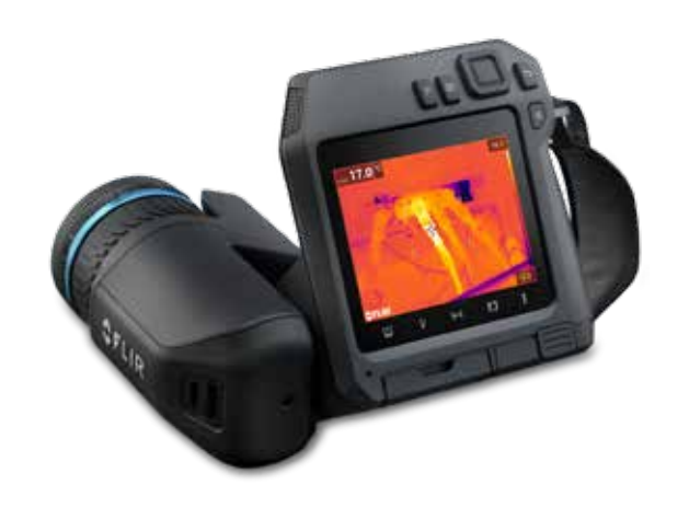
180° rotating optical block and bright 4" LCD make the T500-Series easy to use in any environment