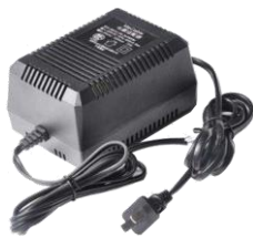
TEAC-66-243000V (EU) MKAC-66-243000U (USA) TEAC-66-243000VB (UK) Power adapter (for outdoor model)