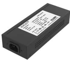
LAS60-57CN-RJ45 Hi-PoE Midspan