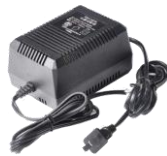
TEAC-66-243000V (EU) MKAC-66-243000U (USA) TEAC-66-243000VB (UK) Power adapter (for outdoor model)