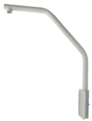
DS-1660ZJ Parapet Mount