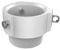
DS-1681ZJ Installation Adapter (for outdoor model)