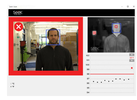
ABOVE ALARM TEMPERATURE