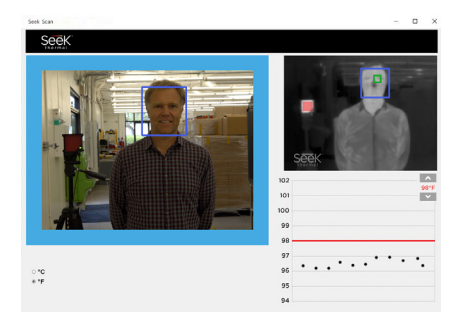
ANALYZING SKIN TEMPERATURE