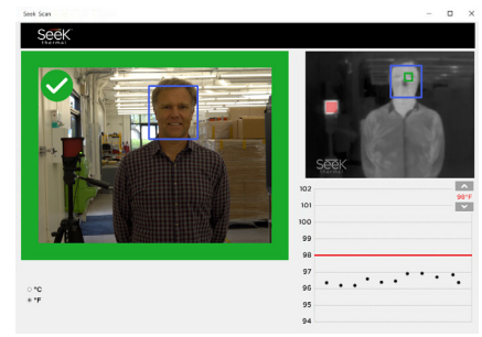
BELOW ALARM TEMPERATURE